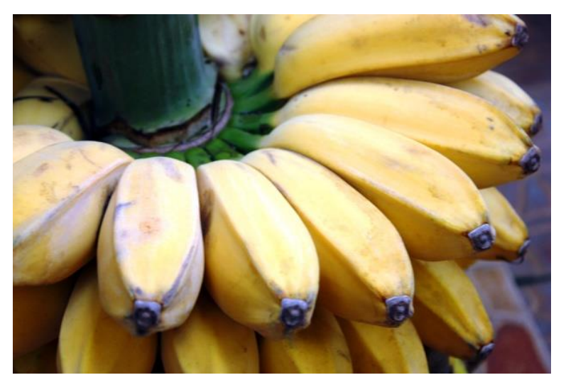
Figure 1. Musa balbisiana fruit

Musa balbisiana peels (MBP; Figure 1 ) have not been used optimally as traditional medicine, even though the fruit is widely used and consumed in the community. The use of this peel can undoubtedly reduce the organic waste of the MBP. The MBP contains high flavonoid content. Based on the results of the phytochemical screening conducted, it was known that the MBP contained flavonoids, alkaloids, tannins, saponins, and triterpenoids<sup>14</sup>. The GC-MS analysis showed that the major component of M. balbisiana extract was difluroisocyanotophosphine<sup>15</sup>. By inhibiting the arachidonic acid metabolic pathway, the formation of prostaglandins, and the release of histamine, flavonoids function as an anti-inflammatory or slow down the inflammatory process<sup>16</sup>. Flavonoids are anti-inflammatory agents because flavonoids in the body act to inhibit lipoxygenase enzymes, the role in leukotriene biosynthesis<sup>17</sup>.