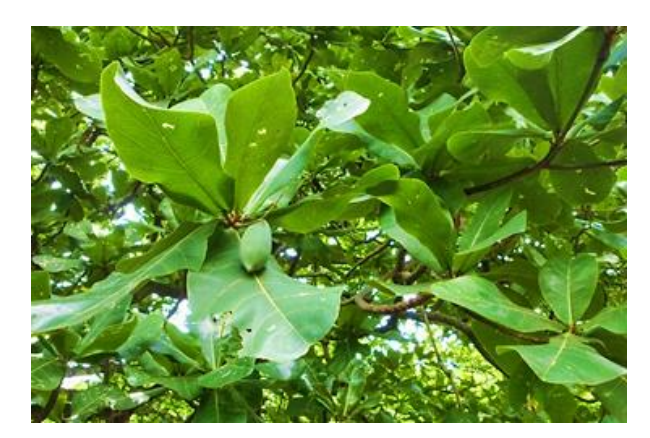
Figure 1. Terminalia catappa leaves

Terminalia catappa leaves were collected in Pekanbaru city and determined at the Botanical Laboratory, Universitas Riau. Samples taken were T. catappa leaves that had fallen around the trees with brownish leaves characteristics. The leaves of T. catappa were shown in Figure 1 .