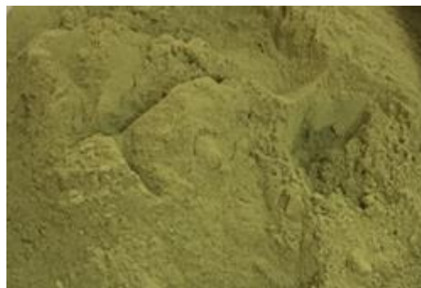
Figure 2. Dillenia suffruticosa leaves powder showed greenish color with a wind-dried method