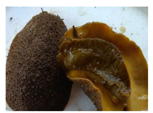
Figure 1. Onchidium typhae

This study material used O. typhae with a length ranging from 4-6 cm in fresh conditions collected from the coast of Sambas, West Kalimantan ( Figure 1 ). The sample was determined with specimen No. 023/A/LB/F.MIPA/UNTAN/2021 at the Biology laboratory, Faculty of Mathematics and Natural Sciences, Universitas Tanjungpura. An antibacterial assay was performed using S. aureus (ATCC 25923) and E. coli (ATCC 25922), for the antifungal assay was performed using Candida albicans (ATCC 102310). Other materials were 1% DMSO, NaCl, 0.5 McFarland standard, sterile distilled water, Brain Heart Infusion (BHI) media, phosphate buffer saline (PBS) solution, and 1% crystals violet. The equipment used at the sample preparation stage was glassware for extraction, sieves, rotary evaporator, chopper, grinder, scales, refrigerator, vortex, and oven. The instrument used in the antibacterial assay was Laminar Air Flow (LAF), incubator (Moderna), micropipette (Socorex), multichannel micropipette (Socorex), microplate flat-bottom polystyrene 96 well (Iwaki), microtiter plate reader (Optic Ivymen System 2100-C, Spain), spectrophotometer UV Genesys 10 UV Scanning, 335903 (Thermo Scientific Spectronic, US), autoclave, and analytical balance (AB204-5, Switzerland).