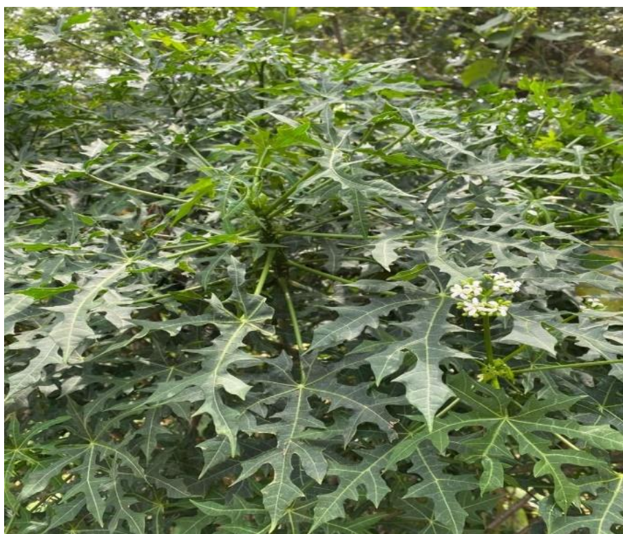
Figure 1. Cnidoscolus aconitifolius (Mill.) I. M. Johnst.

The C. aconitifolius plant is commonly found in tropical and subtropical areas worldwide, including Africa, south of the Sahara, North and South America, India, and Indonesia. Cnidoscolus aconitifolius is commonly consumed as a vegetable in South Western Nigeria, called "Iyana Ipaja" in soups and salads, due to its good nutritional value 16 . Furthermore, in Indonesia, this plant also has utilized as a vegetable and salad. Cnidoscolus aconitifolius leaves have been shown to have a hematinic effect and stabilize erythrocyte membranes on protein-energy malnutrition in rats 17 . It also has anti-diabetic 18 and antibacterial activity 19 . Further characterization showed that it contains phenols, saponins, cardiac glycosides, and phlobatannins 20 .