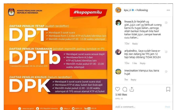
Figure 7 Election Keпо

Based on research that researchers have done on KPU's Instagram account on how the KPU campaign is on Instagram social media, researchers found a campaign strategy carried out by KPU on Instagram on the public using the stages in