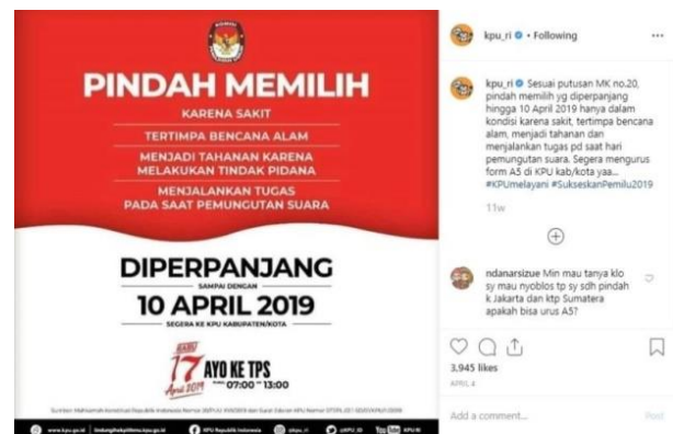
Figure 6 Moving Voters

The following figure is an example of information about elections needed by new voters, including informants of this study. With the socialization using social media, the KPU is more reaching out to the millennial community, which will only be participating in the 2019 elections. In terms of design, it is enough, meaning that in terms of design is not excessive and not harmful, good enough to reach the millennial community. Here are some examples of information provided by KPU accounts on Instagram.