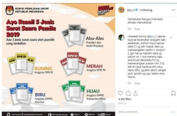
Figure 4 Ballot Socialization

The hashtag is one of the features used by KPU accounts to collect content in a hashtag. It makes it easy for people to get precise and up-to-date information.