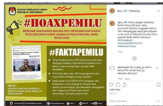
Figure 3 Hoax Posts

Whether or not the problem is explored so that it can enter into the next stage, namely planning. The planning phase is carried out through several aspects, where the KPU itself has a lot of media to communicate and campaign. The element that is pass before reaching the puncture stage is the design stage first. On the other hand, the informant also revealed that there was a desire for the KPU account to become a place for the public to seek the truth of news that was very easy to develop in the community without knowing the origin and purpose.