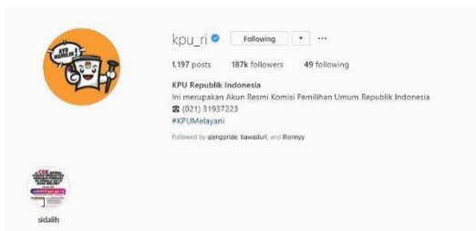
Figure 2 KPU Account Profile

Based on the results of the study, it has found that the KPU has an official account on Instagram. This KPU account is quite frequent in carrying out activities on Instagram. The feature most frequently used by KPU is posting. Posting is one of the features that Instagram has. This feature allows the KPU to upload images to the KPU account so that followers of the KPU account can see it. Besides, this post will enable users to communicate with each other through the comments column and provide likes on specific account posts.