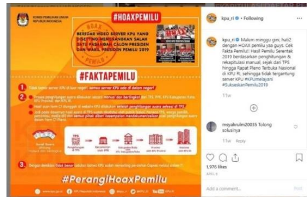
Figure 5 Hoax Posts Source: Instagram KPU